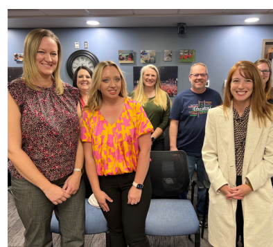
National School Psychologist week!