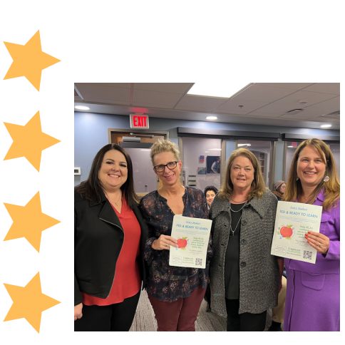
Fed and Ready to Learn Campaign with RCPSF!

Currently, Rapid City Area Schools requires 22 credits for graduation. Seniors have been able to take as many or as few classes as they wanted their senior year as long as they met their eligibility and graduation requirements. Beginning with the 2025-2026 school year, all seniors must enroll in at least five classes for their fall semester. Those five classes may include dual enrollment, capstones, work experience credits, etc. During the spring semester of their senior year, students may enroll in any number of credits/classes they choose as long as they meet eligibility and graduation requirements set forth by Rapid City Area Schools.